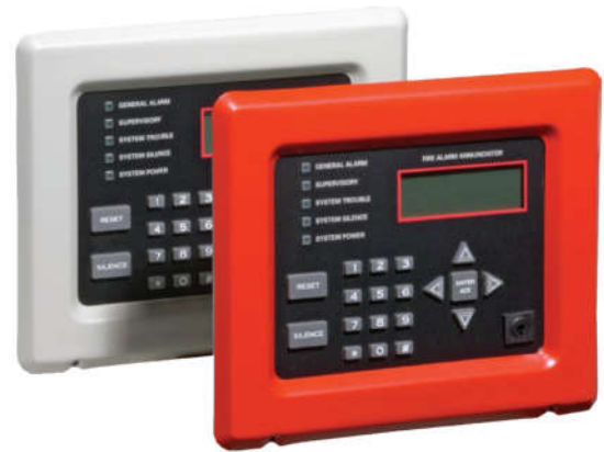
TR-RD1G / TR-RD1R